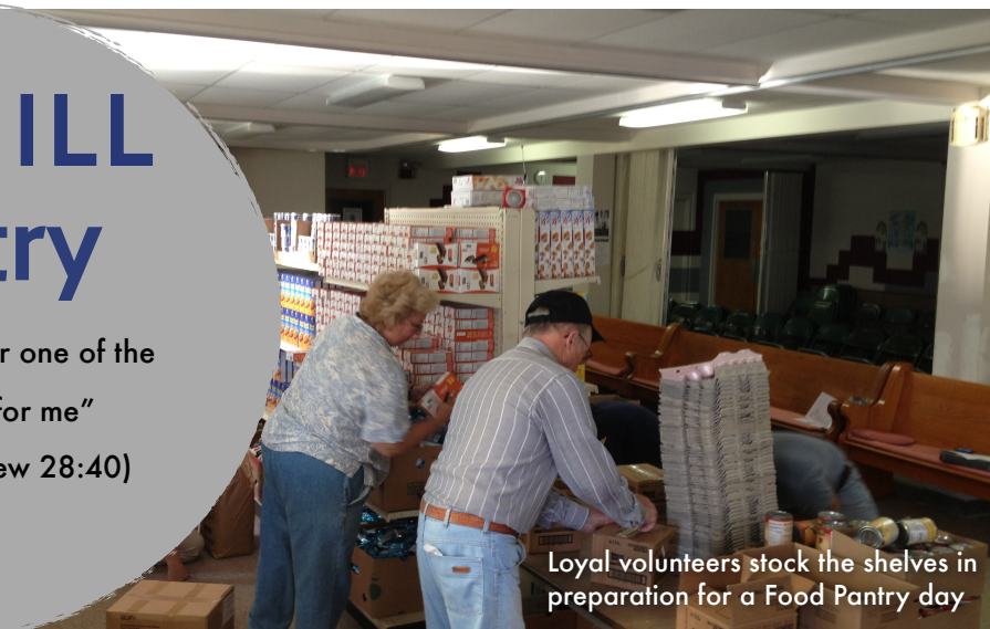
Loyal volunteers stock the shelves in preparation for a Food Pantry day