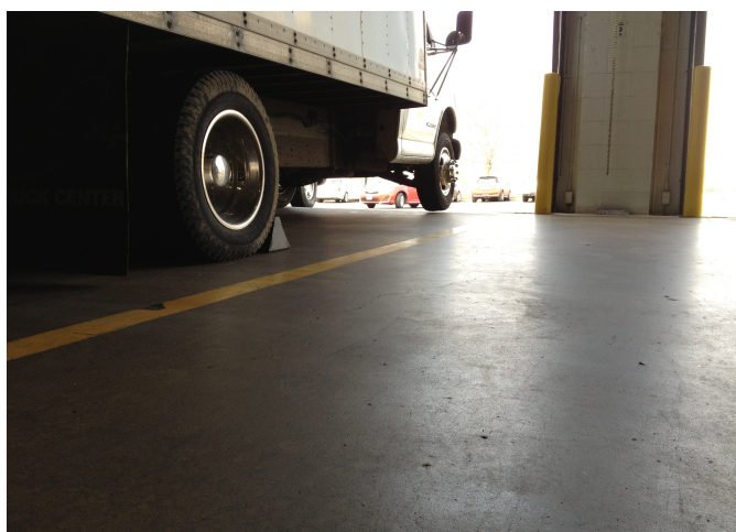
A heavy load from the Akron Regional Food Bank lifts the front tires off the ground. That's a lot of food! (Don't worry, the load was re-arranged before driving home)